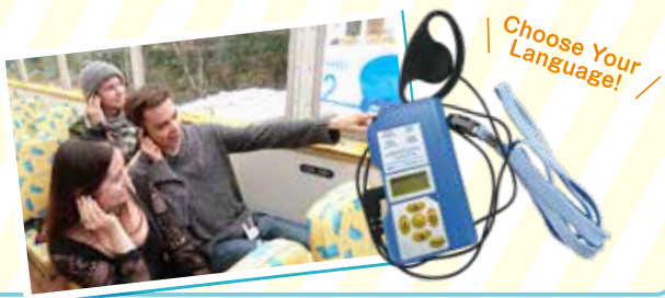
Photo service now available!

* This is originally created for international sightseeing visitors. It may vary from what the attendant is speaking. * This device is not for simultaneous interpretation.